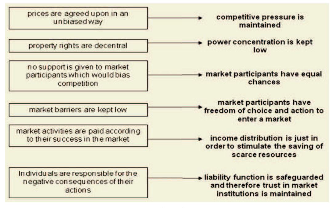
Figure 2: Functions immanent to market economy systems